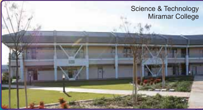
Science & Technology Miramar College

Construction Completed: Mesa College Visual Arts Gallery Miramar College "Leave a Legacy" Plaza City College Learning Resource Center Construction Starts: Mesa College East Campus Improvement Project Continuing Education ECC Skills Center West City Campus Requests for Qualification issued for architects, appraisers, construction managers, material testing, geotechnical and inspection services Awards Continuing Education Skills Center wins Award of Merit for design from Community College Facility Coalition