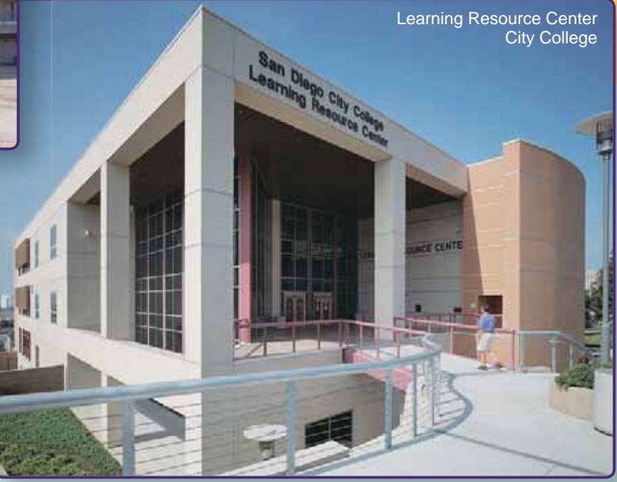
Learning Resource Center City College

Awards Miramar's Science and Technology and Arts & Humanities buildings win Project of Distinction in 2008 Education Design Showcase Construction Starts: Mesa College Muir Renovation Infrastructure - Phase I (fire and utilities upgrades) Student Services Miramar College Technology Building Student/Campus Center Arts & Humanities Building Library/Learning Resource Center Automotive Career Instructional Building Expansion Heavy Duty Advanced Transportation Tech Center