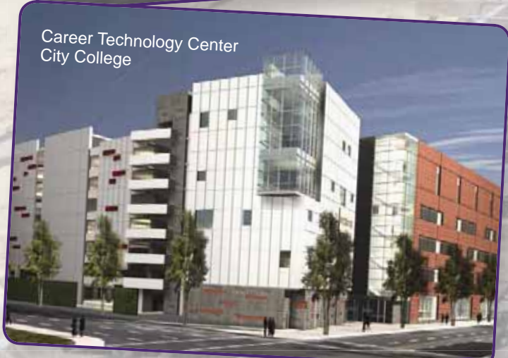
Career Technology Center City College