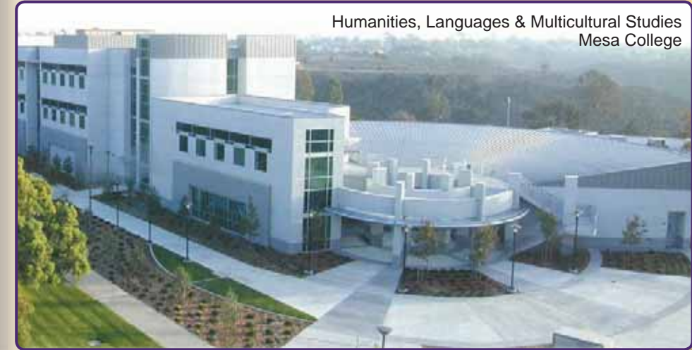
Humanities, Languages & Multicultural Studies Mesa College

Construction Completed: Mesa College Humanities, Languages & Multicultural Studies Building Land Acquisition Starts: City, Mesa and Continuing Education Facilities Planning: Comprehensive Master Plans start for all colleges and Continuing Education