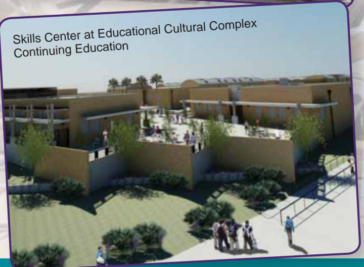
Skills Center at Educational Cultural Complex Continuing Education