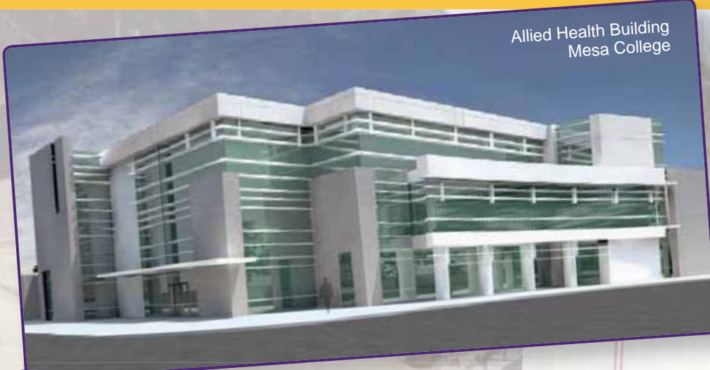
Allied Health Building Mesa College

Building a Stronger Economy and Future Jobs